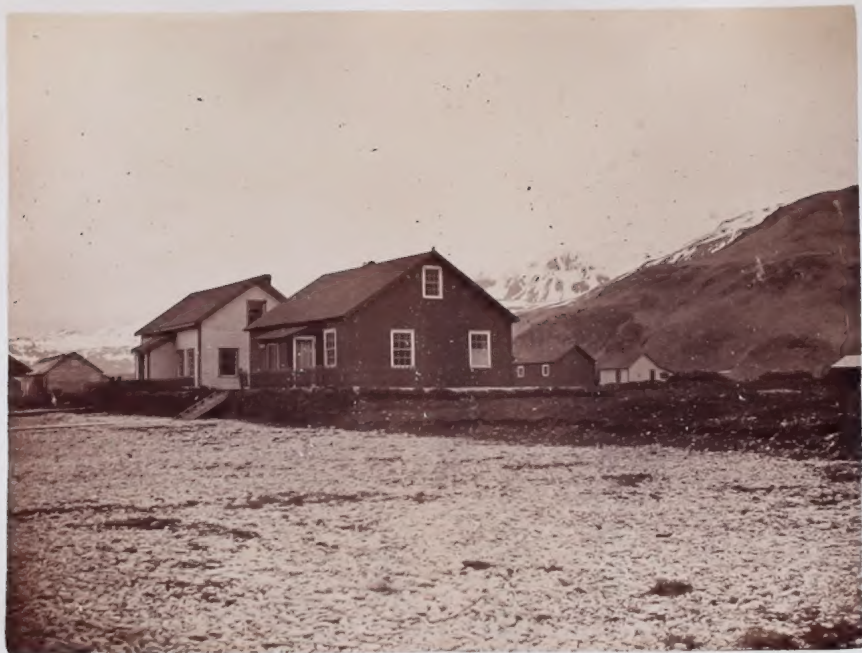
Houses in Unalaska